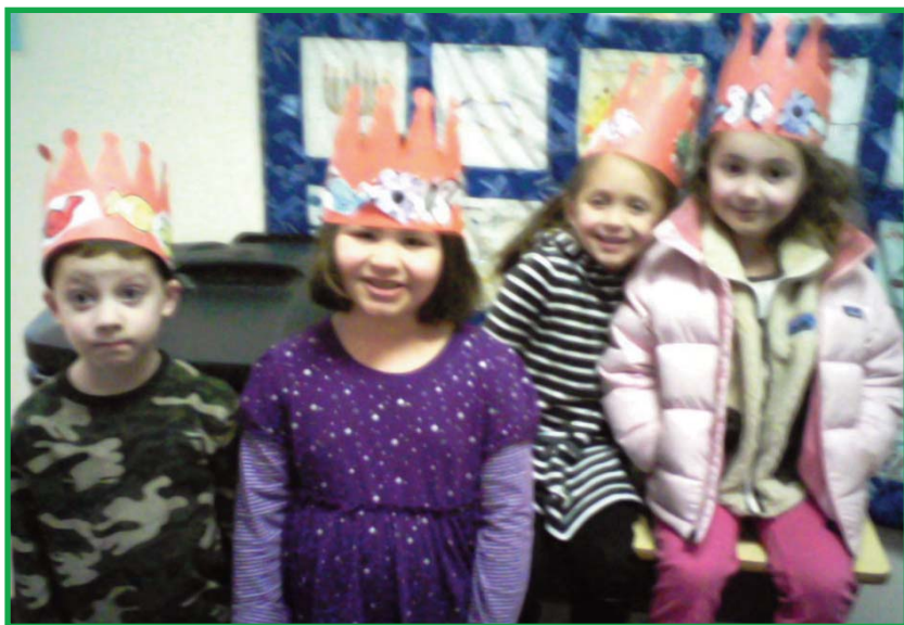
Pre-K/K students on Tu' B'Shvat